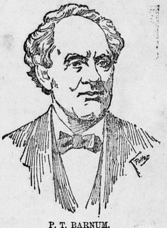
P. T. BARNUM.