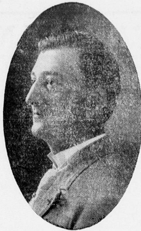
LAWTON T. HEMANS Democratic Nominee for Governor.