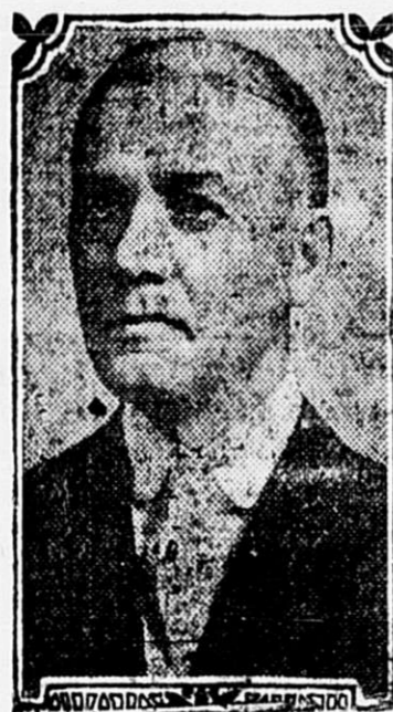
CHARLES E. TOWNSEND Republican Nominee for United States Senator.

In parts of the west, where the mail must be carried for many miles on horseback, special pouches are in use for slinging over the animals' flanks. In the far frozen north special bags are made for sled transportation. Harper's Weekly informs us, and in the cities a bag in use for pneumatic tube service is made of a composition called "leatheroid." The ordinary cotton mail bags are woven so closely that they are practically waterproof, and in the weave there are 13 stripes of blue. Each country marks its own mail pouches in some individual way, so that if one gets lost in a far country its ownership can be readily detected.