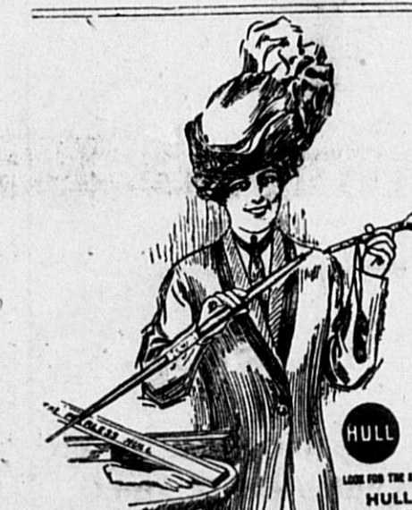
HULL UMBRELLAS DETACHABLE HANDLES

For Baby Bracelet Ring Baby Spoon Baby Set of Spoon, Knife and Fork Set of Pins Bib Holder Cups Neck Chain Etc.