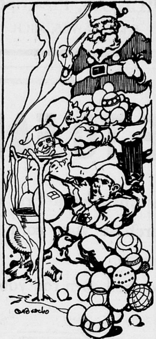
SHOWING THE FINISHED TOYS TO SANTA CLAUS.

Each caldron boils a different jewel. The melted rubies make blood red bubbles that gleam like flames. The dia-