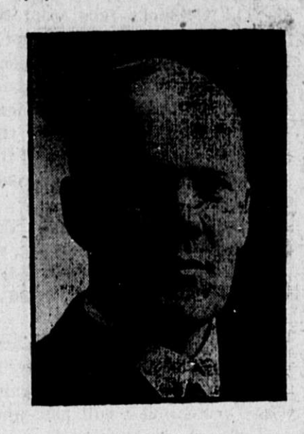
For State Senator

Because of limited means and ten counties to cover it will be impossible to meet all of the voters of the district. However I wish you to know at least a problem of dealing with malcontents few of the aims and ideals for which I among them, shipped the disgruntled stand and I therefore submit the fol. whereabouts of same kindly notify J.