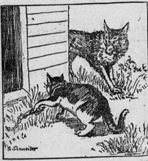
Mr. Cat Was Caught in the Trap.