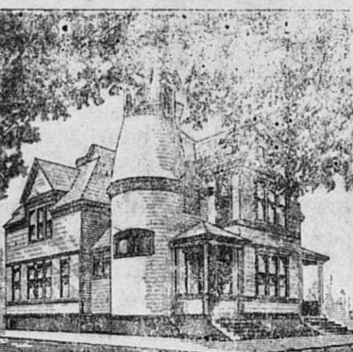
TAWAS CITY PUBLIC SCHOOLS