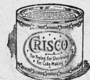
for homes that want the best in cooking

TELEPHONE US! FREE DELIVERY Note Advs in Locals