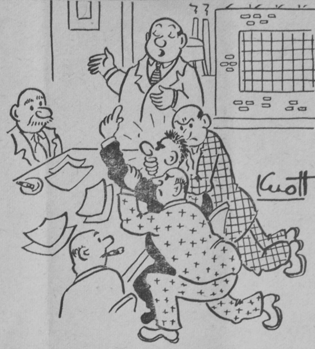
"Then the motion is passed without a dissenting vote."

Refreshments were served in the Home Arts room by seventh and tenth grade mothers.