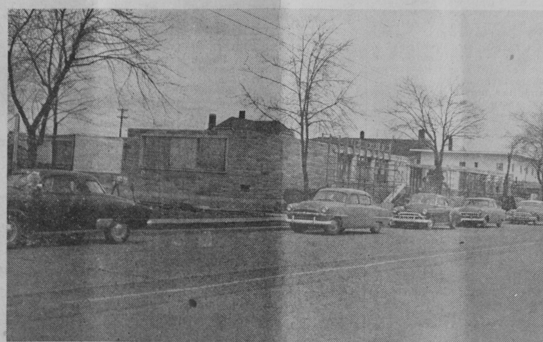
Where cornerstone ceremony will be held at 1:30 next Tuesday afternoon. Walls under construction as they appeared Thursday of this week.