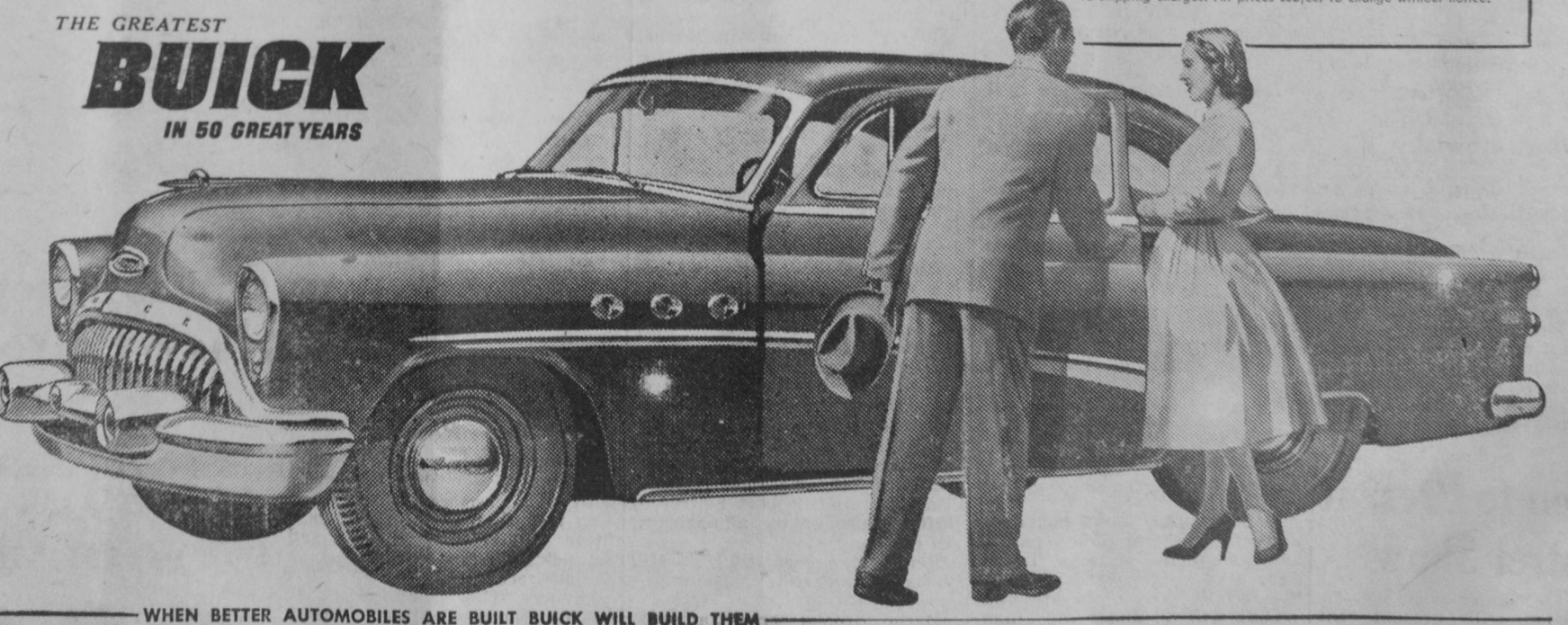
WHEN BETTER AUTOMOBILES ARE BUILT BUICK WILL BUILD THEM

That's the price of the new 1953 Buick SPECIAL 2-Door 6-Passenger Sedan Model 48D, illustrated, Delivered locally