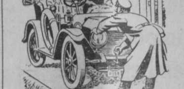
was automobile dealers. A dinner and party at the Barnes Hotel has been arranged.

While here Friday night and Saturday morning the members of the club will be guests of Tawas.