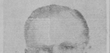
ner supervises all field services' personnel and the work of 10 Farm Bureau districts representatives. He has had a wide experience in farm cooperatives and Farm Bureau work and now holds the position of director of member services.