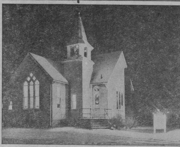
Lighted buildings, such as this neighborhood church, are good subjects for night shooting.