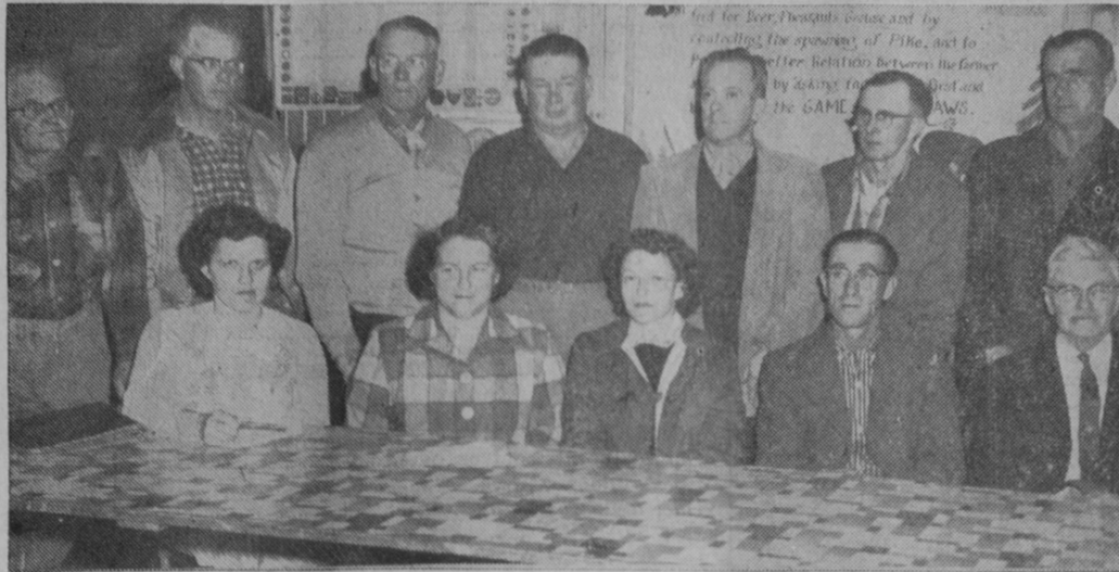
1958 IOSCO COUNTY FAIR BOARD

Rule 14—Exhibits to be released at 4:00 p. m. Saturday, July 26. If taken before, prizes will be forfeited.