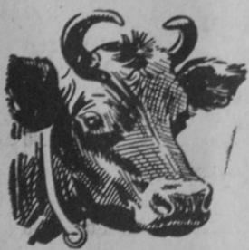
(Continued on Page 6)

2. Passed blood test for Brucellosis (Bang's disease) from official laboratory as follows: (a) Male or female cattle over twelve months of age (except as