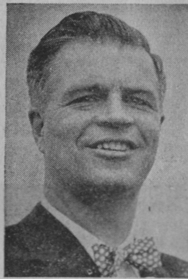
G. MENNEN WILLIAMS Governor