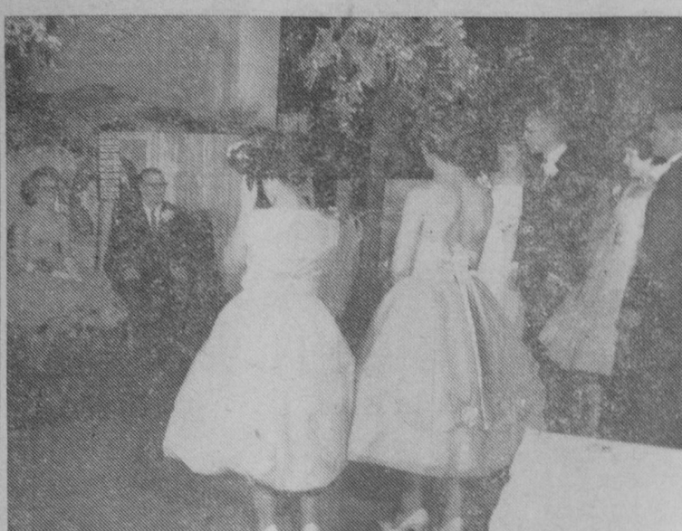
DECORATIONS for Saturday night's junior prom included an Hawaiian "grass hut" for picture taking purposes. Some of the snapshooters are shown here.

BAKING Best loaf white bread or best cake. All special county fair exhibits will be judged before the opening of the Michigan State Fair, September 1 through September 10, 1961. If your fair immediately precedes or comes after the state fair, gold ribbon winners may take their entries at the 1962 state fair.