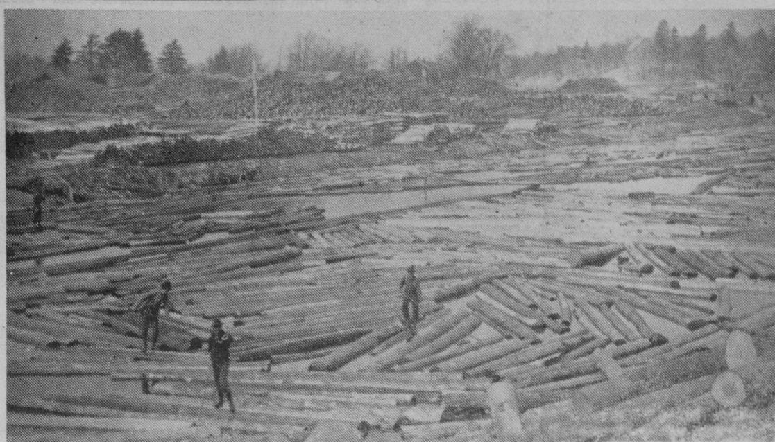
CEDAR LOGS in the "boom yard" on the AuSable River. During the fire of 1911, flames enveloped this area rapidly and then spread to the populated sections of Oscoda and AuSable.