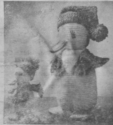
ducklings just as I did with that long-ago crocheted puppy.

You know, when I was a child, I think there was nothing I was more fond of than my knitted or crocheted toys. When I was about five, I remember, I had a little crocheted puppy that went everywhere with me. I'd grab him by the ear—wade with him through puddles—take him to bed with me. We belonged to each other. And it was some time until I was in love with someone again the way I was with him.