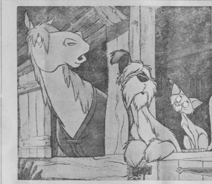
STARTING TONIGHT at the Family Theatre in East Tawas, is Walt Disney's "One Hundred and One Dalmatians." His delightfully different all-cartoon feature will please the whole family.

Adult help is urgently needed. Without more adult assistance, the program may be drastically reduced.