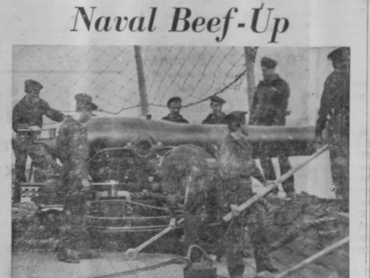
WASHINGTON, D.C.—May 6—This week's call by President Lincoln for volunteers included a summons for 18,000 seamen to participate in blockade service at Southern ports. Shown above are sailors in a typical drill aboard a Union man-of-war. Mr. Lincoln also called for some 42,000 three-year Army volunteers. Naval strength now stands at only 7,000 officers and men.