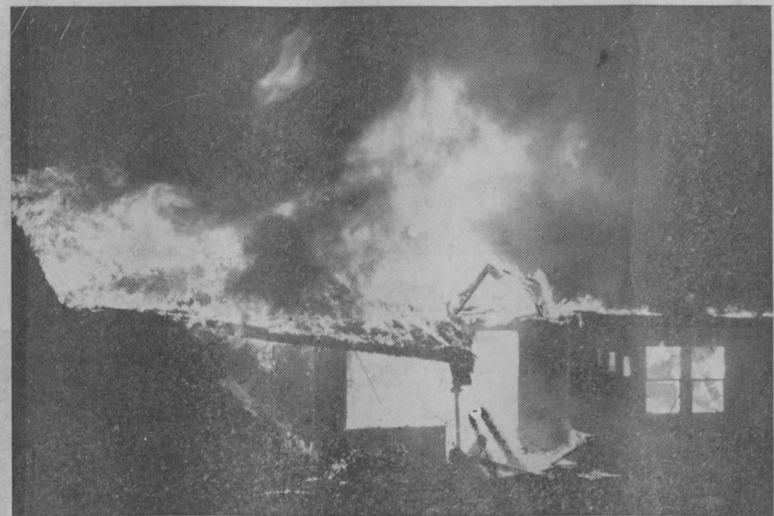
THIS PICTURE was snapped shortly after the Wednesday morning. The blaze was already beyond control and the building was completely demolished.

The course dealt with the principles of fire, inland marine, casualty insurance, bonds and the application of these forms of protection to the requirements of individuals and business concerns. The information was developed through group discussion of actual cases and problems under the supervision of the school staff.