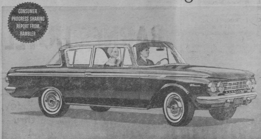
All-New Rambler Classic 2-Door Sedan—Lounge-Tilt Seat, Bucket Reclining Seats, optional.