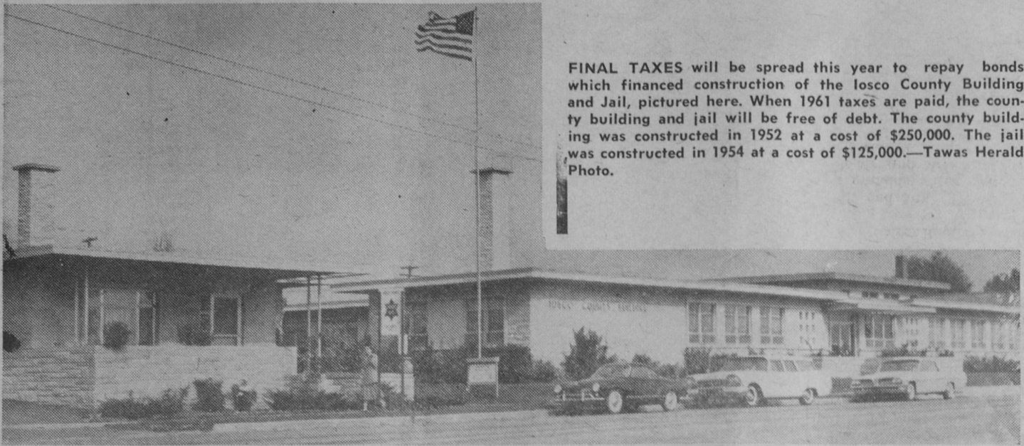
FINAL TAXES will be spread this year to repay bonds which financed construction of the Iosco County Building and Jail, pictured here. When 1961 taxes are paid, the county building and jail will be free of debt. The county building was constructed in 1952 at a cost of $250,000. The jail was constructed in 1954 at a cost of $125,000.