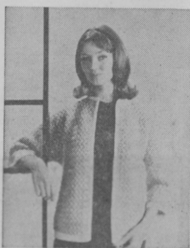
A sensational black with a beige trim would be elegant with your dark sheaths.

THE LONGER CHANEL JACKET IS AN ELEGANT AND CURRENT FASHION HIGHLIGHT. It will look just about perfect with anything in your wardrobe, keep you wonderfully warm and yet has a frothy light and delicate look about it.