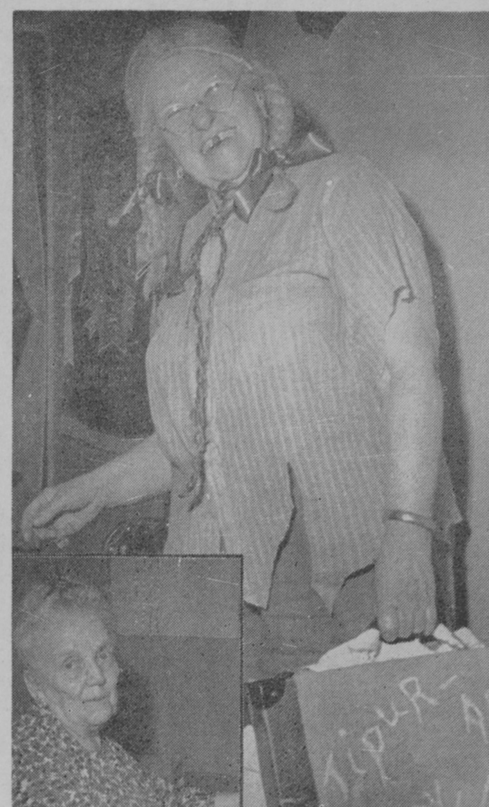
WEARING THE GREEN—Tawas Senior Citizens Group held its St. Patrick's Day pot-luck dinner last Wednesday at the VFW Post Home.

*Reddy Kilowatt, Your Electric Servant BIGGEST BARGAIN IN THE FAMILY BUDGET CONSUMERS POWER COMPANY