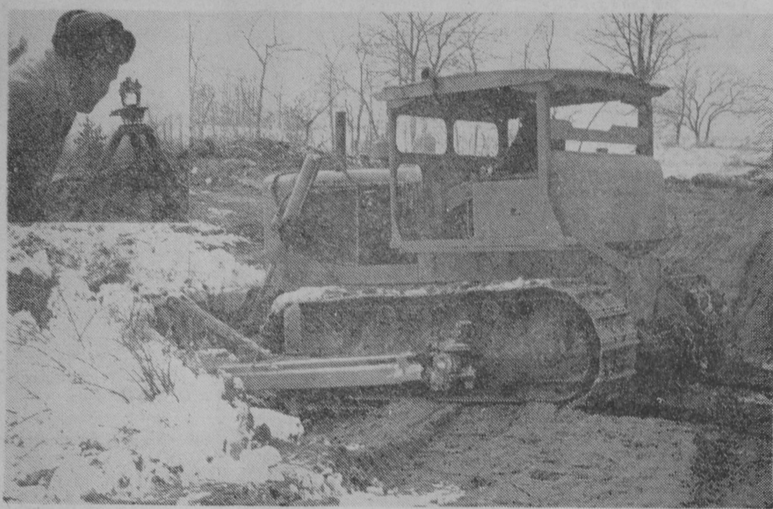
GROUND was broken last week for the new Tawas Point State Park. One of the three bulldozers being used to construct new roads and campsites is pictured above. A workman "shoots" an elevation in the inset at left. The project is to be completed by July 1, according to Raymond Prosch, park manager. Construction of sewer and water mains are to be included.

See me for details! NEIL LUEDTKE 200 W. State St. East Tawas MODERN WOODMEN OF AMERICA Home Office, Rock Island, Ill.