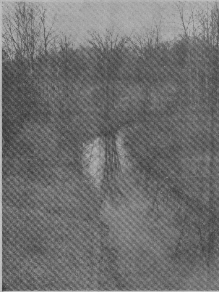
THIS VIEW of Johnson Creek, which will soon become a man-made lake in Burleigh Township south of Whittemore, was snapped Sunday from the M-65 bridge. Residents expect the lake to become a popular recreation center.