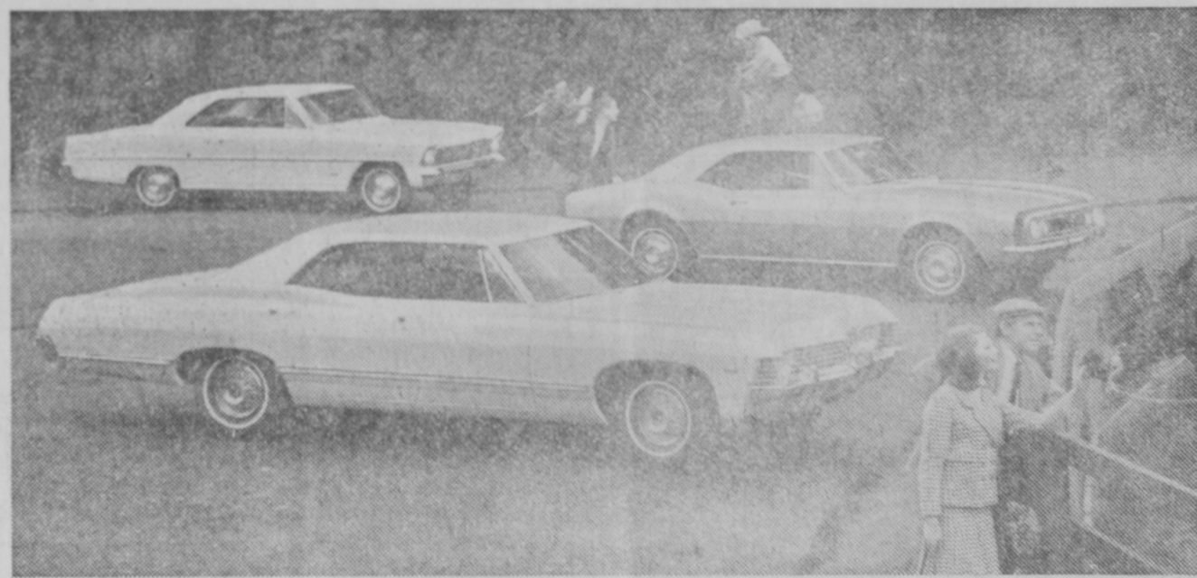
Top left: Chevy II Nova Sport Coupe. Foreground: Chevrolet Impala Sport Sedan. Top right: Camaro Sport Coupe.