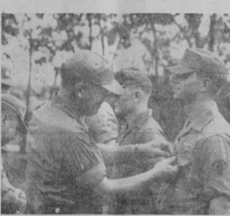
IN THE SERVICE—