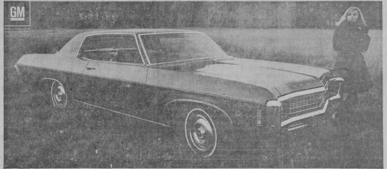
Putting you first, keeps us first. '69 Impala Custom Coupe

Start with an Impala Custom Coupe. Add our Turbo Hydra-matic transmission, a 300-hp V8, power disc brakes, whitewalls and wheel covers. And it will cost less than a '68 Impala did with comparable equipment. $101.00* less.