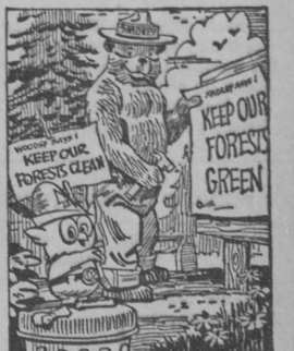
They need your help for a better outdoors!