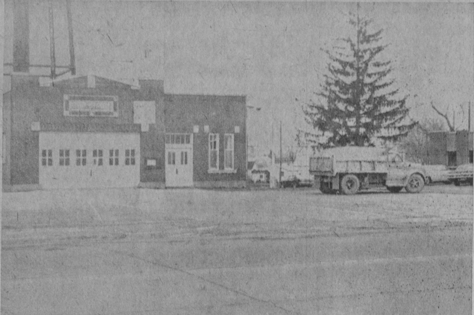
MICHIGAN'S MOTOR VEHICLE CODE applies only to the highway entrance at the city hall in Tawas City (above) and not to the fire hall doors or ramp leading to Lake Street (US-23), according to an opinion by Kenneth Myles, city attorney. At a recent meeting of the city council, a question was raised concerning possible violation of the state code because parking was allowed on both sides of the fire truck ramp leading to the highway. Myles said the code clearly refers to the highway entrance and not to doors of the building or the ramp. He said, too, that any attempt by the state to regulate parking through the motor vehicle code would be unconstitutional, unless the title to the vehicle code was revised to include parking lots.