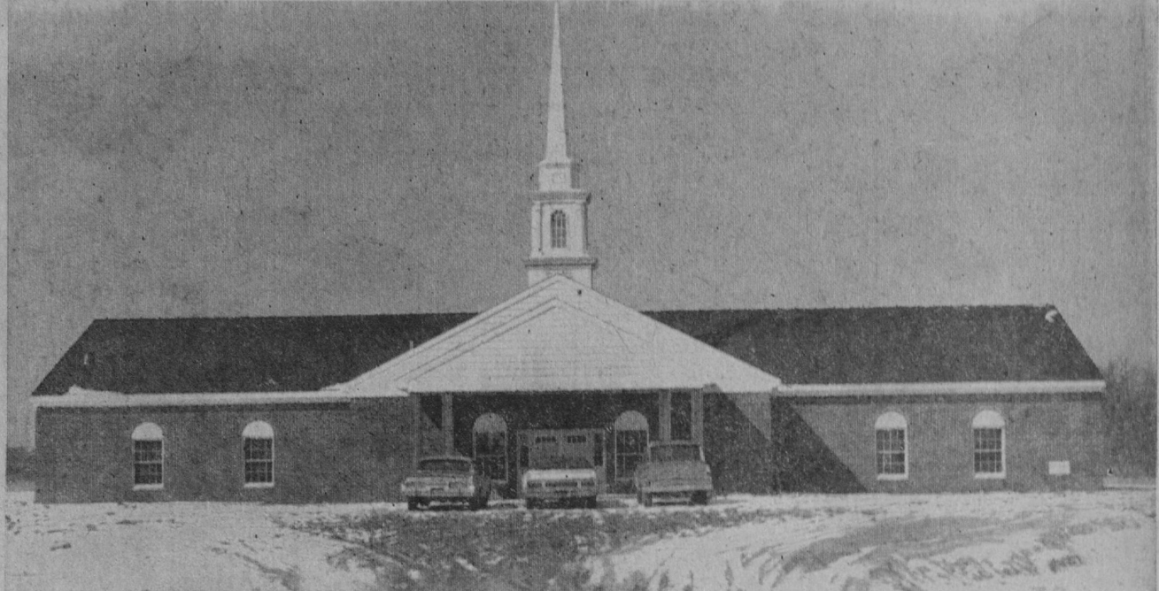
FIRST SERVICE in the new Hale Baptist Church was held Easter Sunday and the congregation set a new record attendance, breaking the old record which had been established the previous Sunday when the last service was held in the old church.