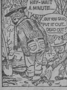
Keep warming fires from becoming wildfires!