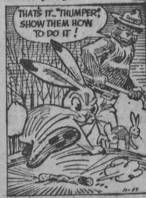
Crush those smokes... Folks!