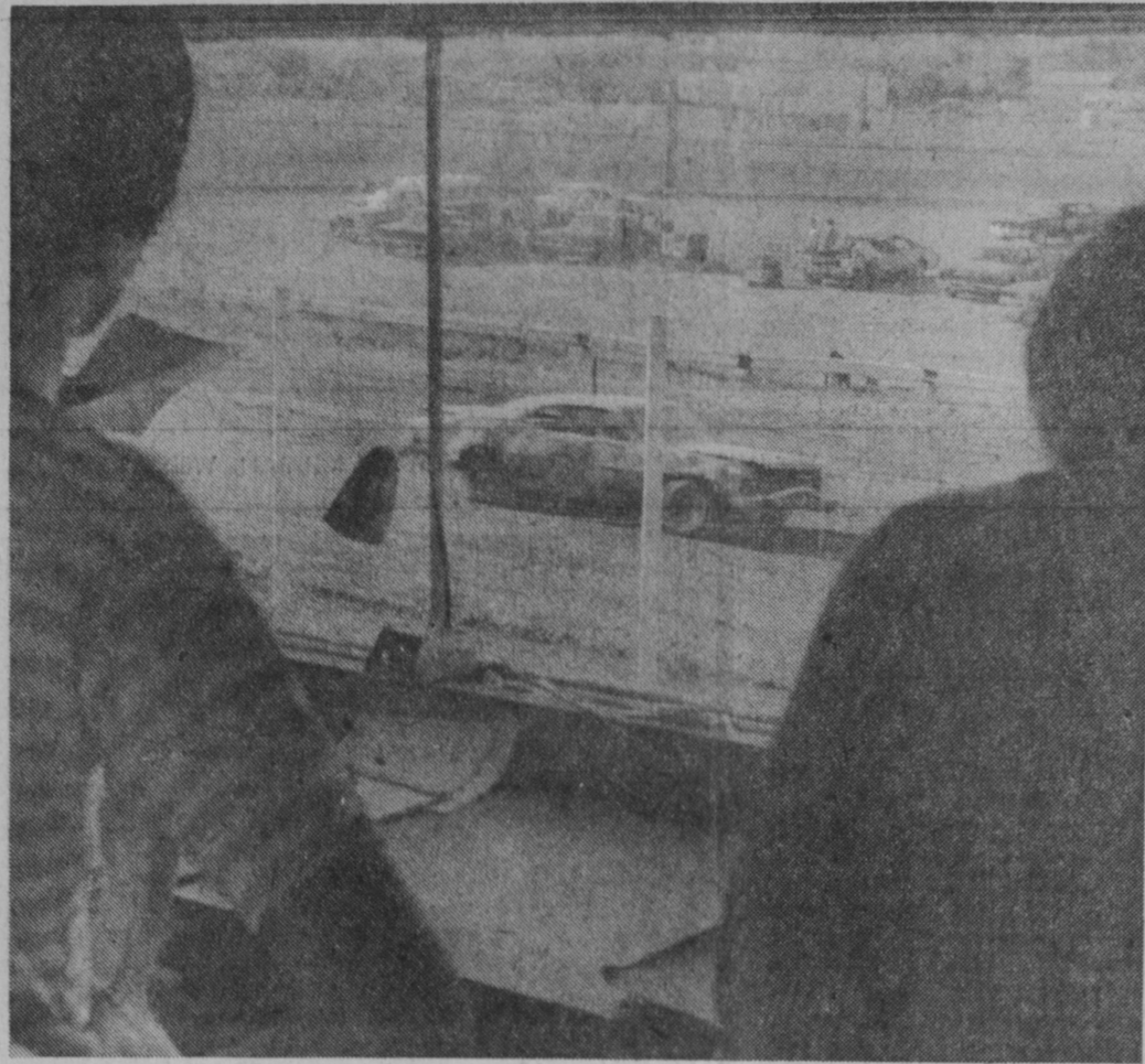
WHITTEMORE SPEEDWAY held its annual mid-season trophy races last Saturday night with another capacity crowd in attendance. These pictures were snapped during time trials for the regular weekly program. The top picture shows track officials timing cars during the prelim-