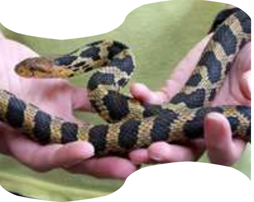
Fox Snake at Michigan Snakes Alive program.